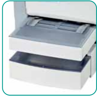
Additional paper tray (optional)