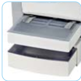
Additional paper tray (optional)